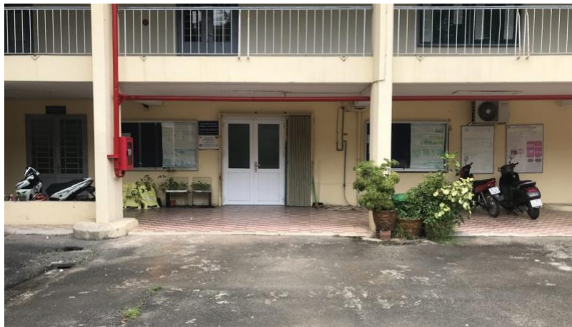
Fig 2. Main laboratory https://goo.gl/maps/Y43Grg6BAd7KccF89